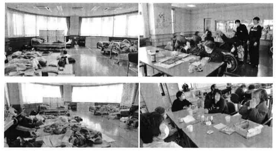
Figure 2. Specially Designated Shelter at Miyagino Day Service Center for PWD, Sendai City (April 5, 2011).

preparations, some responded to the city administration request quickly and others voluntarily initiated sheltering operations (see Figure 2) (Tatsuki and Ishikawa, 2011). In total, 40 shelters operated and served 288 individuals in Sendai from March 11 to the end of May (Sendai city, 2011).